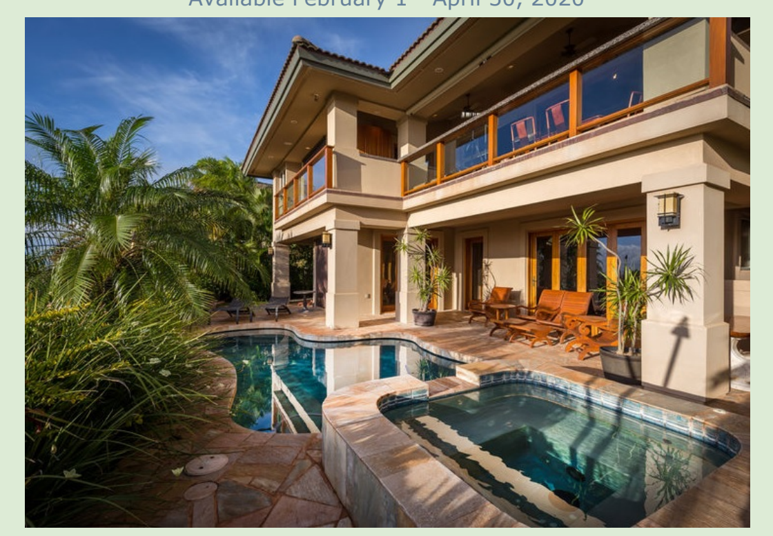
Chateau Margo Destin, Florida

T3307 Available February 1 - April 30, 2020