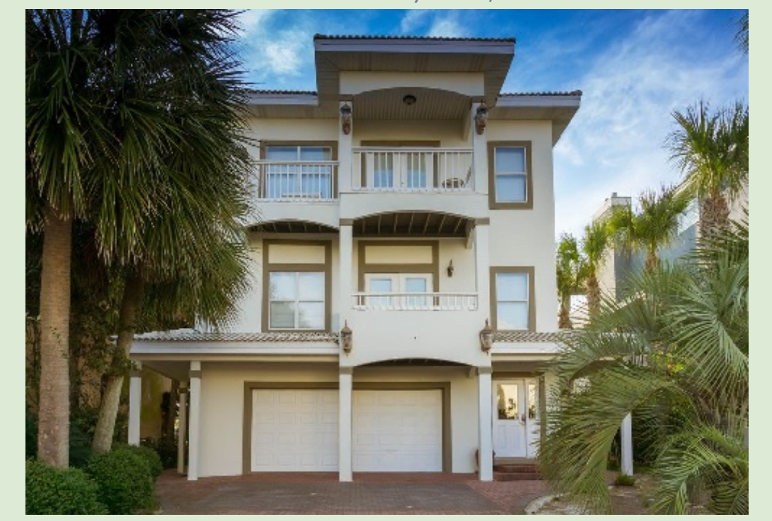
"Give us a week and we'll give you the world!"