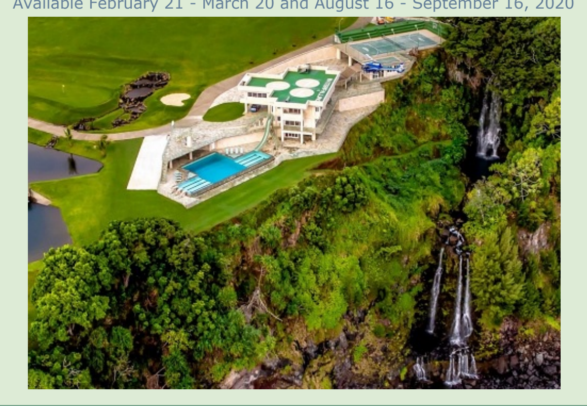
Villa C'est La Vie Gros Islet, St. Lucia <u>T2346</u>

T3126 Available February 21 - March 20 and August 16 - September 16, 2020