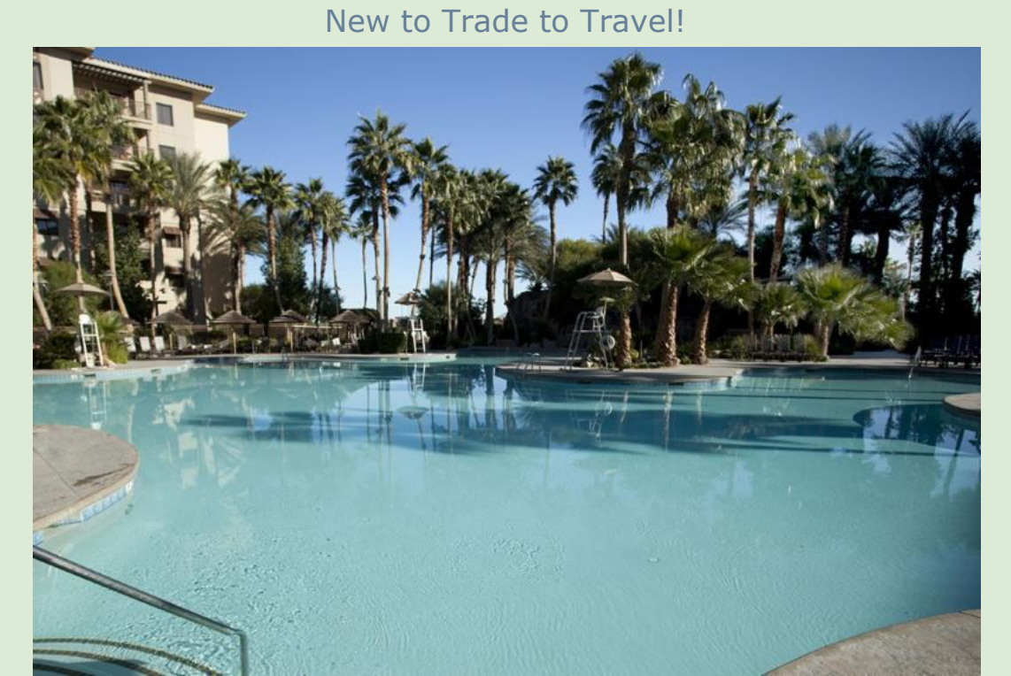
Villa Las Palmas Punta Cana, Dominican Republic T2875 Available May 26 - June 2 and June 16-30