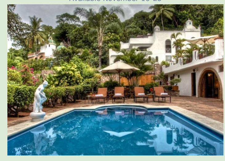
Casa Angel Acapulco, Mexico <u>T2604</u>