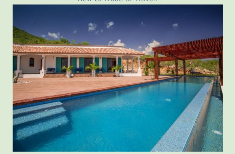
"Give us a week and we'll give you the world!"