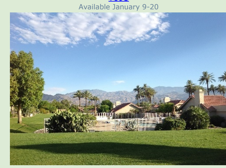
Casa Del Azul Buena Vista, Mexico <u>T3263</u> New to Trade to Travel!